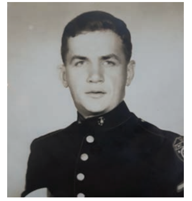
Follow us for updates – CountrySideLakes.com